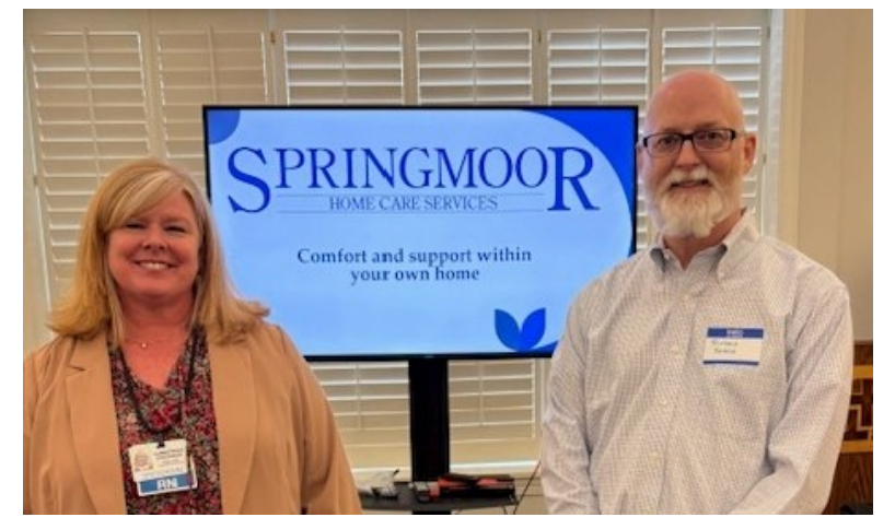
Guest speakers from Springmoor to talk about a new program for home health care.