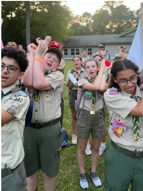
Troops 342 and 342-G are in formation, in uniform, with their Troop Flags preparing for a fun-filled campfire program. They are singing "The Jellyfish Song" which demonstrates how these Scouts embrace Scout Spirit!

It has been a busy summer! We hope you'll enjoy these photos of the troop in action at Camp Durant!