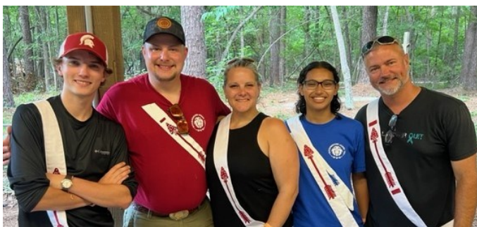
Order of the Arrow numbers are growing amongst Scouts and Scouters alike. Pictured is an ice-cream social and patch trading sponsored by Camp Durant for OA members only.