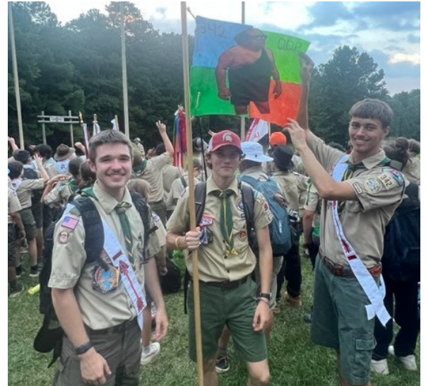
The "Danny DeVito Patrol" is the longest standing patrol within the Troops and usually for senior leaders in Scouting. Pictured are the three senior boys from this patrol at their last summer camp as Scouts.