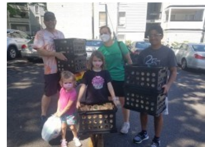
Some of our volunteers in May